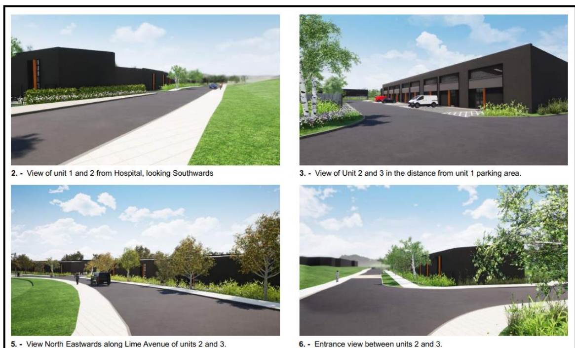
Figure 2 – Indicative Street Scene Images

satisfied that the scale and linear form of the proposed buildings, which predominantly run parallel to the main street, are in keeping with the character of other existing and proposed employment buildings located within 'The Works' site. Whilst the proposed buildings (most notably buildings 2 and 3) would ideally front on to Lime Avenue in order to create a more active street scene, it is recognised that the physical constraints of the site have largely dictated the layout and buildings' orientations. It is also acknowledged that the proposed site layout has been revised to position proposed building 3 as far as possible away from Lime Avenue in order to allow a sufficient landscape buffer to be provided between the new footpath and the building (see Figure 2 – Indicative Street Images below). In doing so, the physical impact of the building on Lime Avenue has been reduced to some degree.