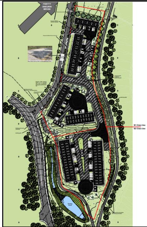
Figure 1 – Site Layout

1.4 The approximate dimensions of the proposed buildings is as follows: